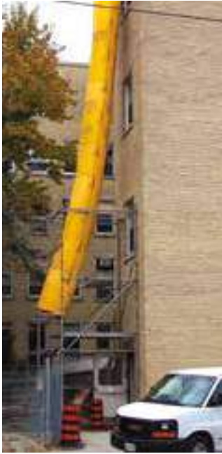
TYPICAL INSTALLATION ON SYSTEM SCAFFOLD