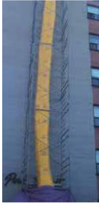
TYPICAL INSTALLATION ON FRAME SCAFFOLD