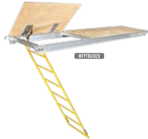
B PLATFORM WITH ACCESS DOOR AND LADDER