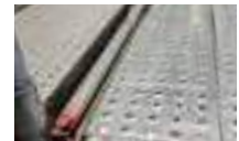
WITHOUT INFILL PLANK