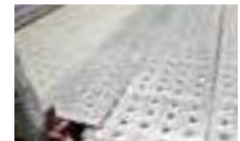
WITH INFILL PLANK