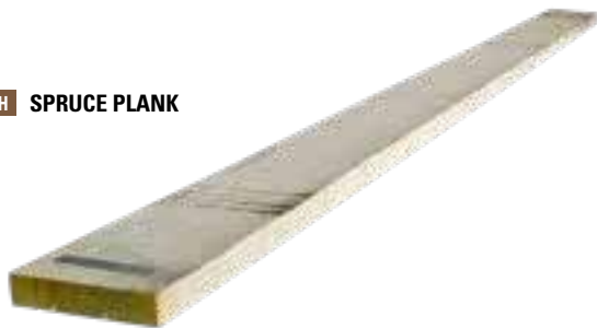
H SPRUCE PLANK