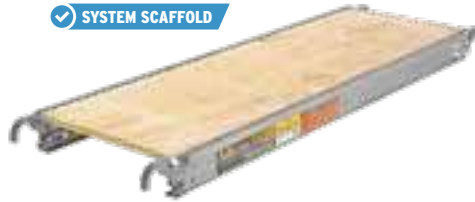
D SYSTEM SCAFFOLD PLATFORM ✓ SYSTEM SCAFFOLD