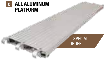
C ALL ALUMINUM PLATFORM