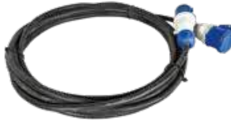
B REMOTE CONTROL EXTENSION