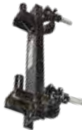
E POST MOUNT FOR SCORPIO XI HOIST