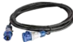
F REMOTE CONTROL EXTENSION