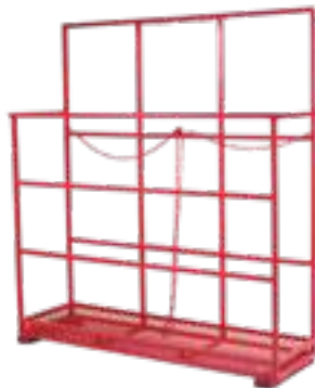
K FRAME SCAFFOLD CARRIER