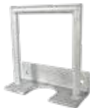
H HOIST CABESTAN BRACKET ATTCAB

G Load capacity: 1000 lb Speed: 40 ft. / minute Required voltage: 110V