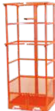
L SYSTEM SCAFFOLD CARRIER