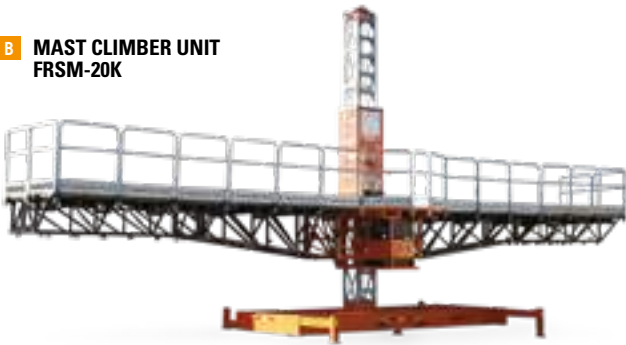
B MAST CLIMBER UNIT FRSM-20K