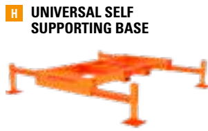
H UNIVERSAL SELF SUPPORTING BASE