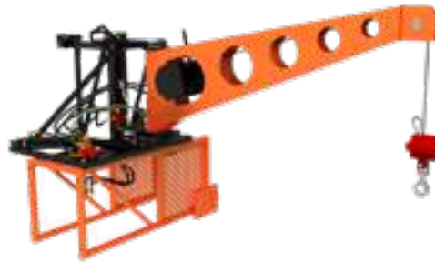
C PORTABLE CRANE FRH-4000 FOR 20" X 20" MAST