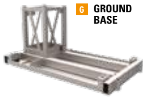
G GROUND BASE