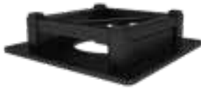
I ADD-ON BASE