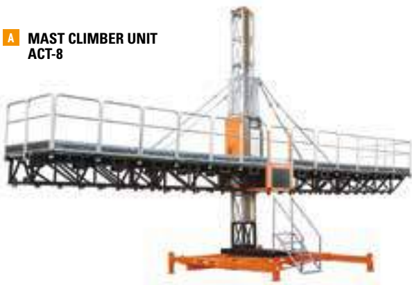
A MAST CLIMBER UNIT ACT-8