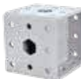
P HUB PAINTED YELLOW