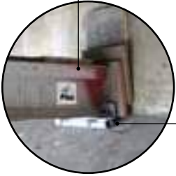
B IRON ANGLE SUPPORT FOR ALUMINUM BEAM