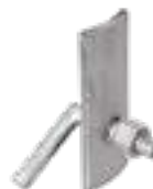
Q EFCO / TUFSTUD "L" CLIP